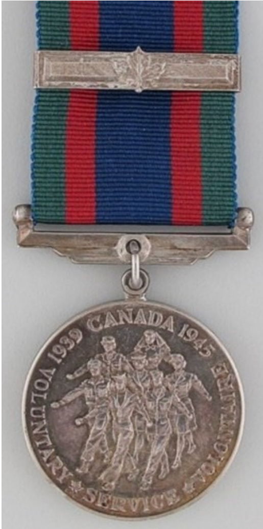
Voluntary Service Medal